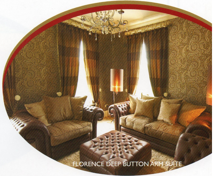
FLORENCE DEEP BUTTON ARM SUITE