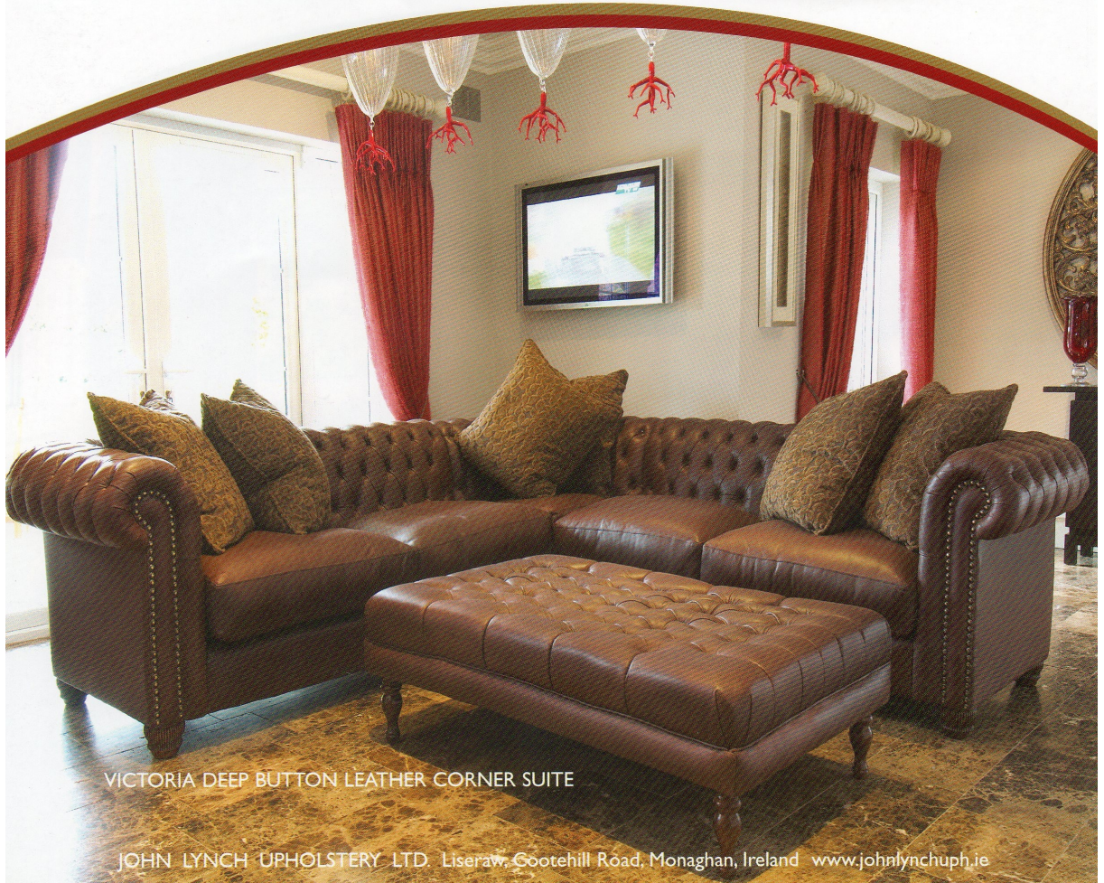
VICTORIA DEEP BUTTON LEATHER CORNER SUITE

JOHN LYNCH UPHOLSTERY LTD. Liseraw, Cootehill Road, Monaghan, Ireland www.johnlynchuph.ie